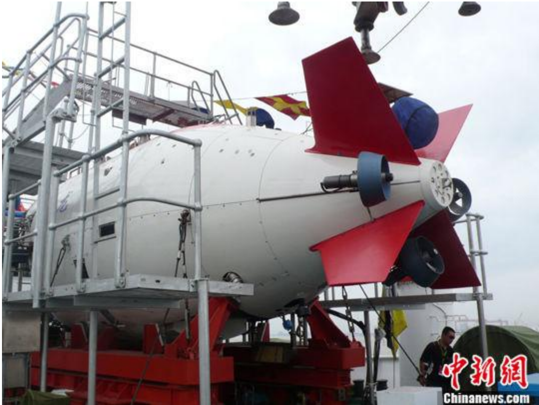
“Jiaolong”, a manned submarine probe to be launched from a boat.

Xiangyanghong-09, a mother ship designed to test submarine probes, set sail from Jiangyin on July 1, 2011. During the 47-day journey over the eastern Pacific Ocean, the ship released Jiaolong, a manned submarine probe, to investigate polymetallic nodules at a depth of 5000m in the northeast Pacific contract area. The submarine capsule, carrying one submariner and two scientists, will investigate the marine resources and work on designed missions at a depth of 5000m. With a 5000m dive capability, China will be able to stretch its deepwater probe activity to more than 70% of the global ocean floor.