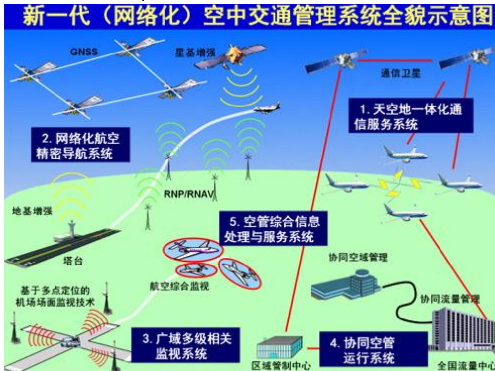
New generation air traffic control system.

Aviation Administration of China have jointly initiated a project to work on the new generation air traffic control management system, which rolled out 63 key technologies, 7 domestic or international technical standards, 140 patent applications, 13 technology systems or platforms, 34 applications, and 1 first prize of National Technology Invention Award, covering the areas of performance-based aviation navigation, data link and precise positioning based comprehensive air surveillance, collaborative air traffic control, and civic air traffic control information platform.