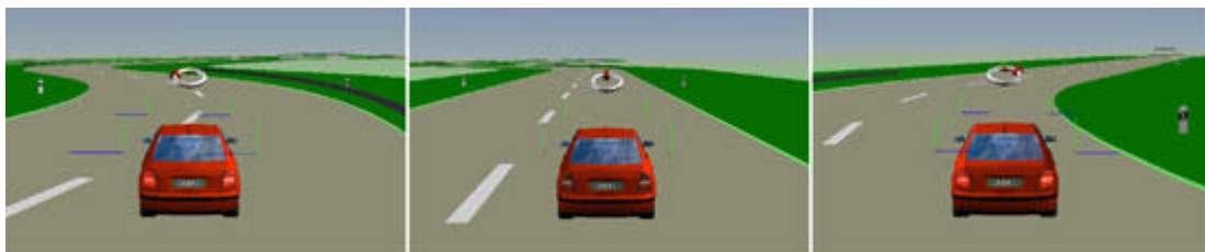
Turn left, gear up, and turn right