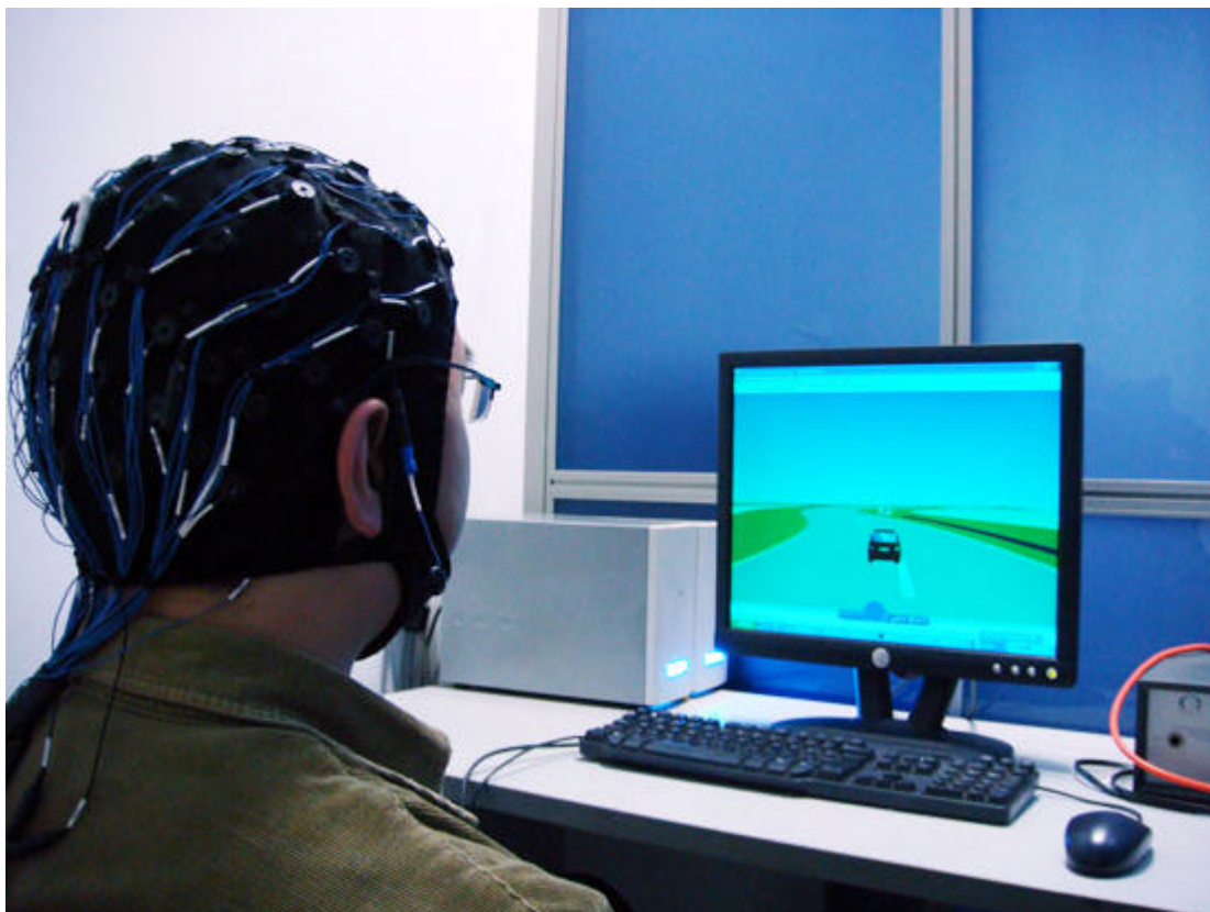
A volunteer is driving a car using his brain signals